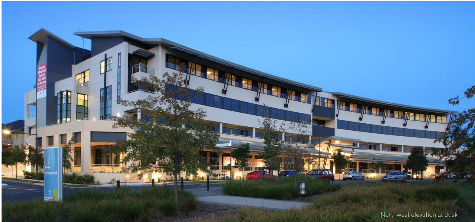
Northwest elevation at dusk