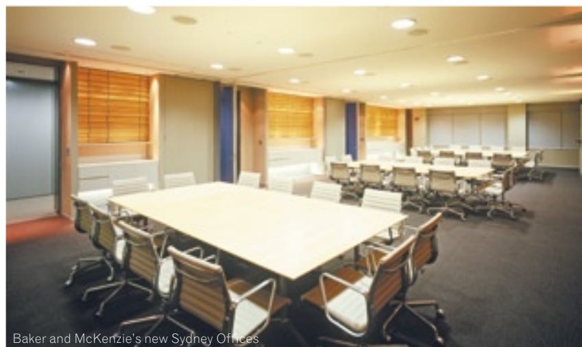
Baker and McKenzie's new Sydney Offices